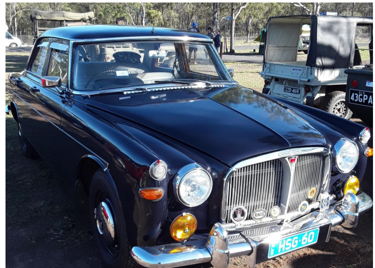
Rovers on display