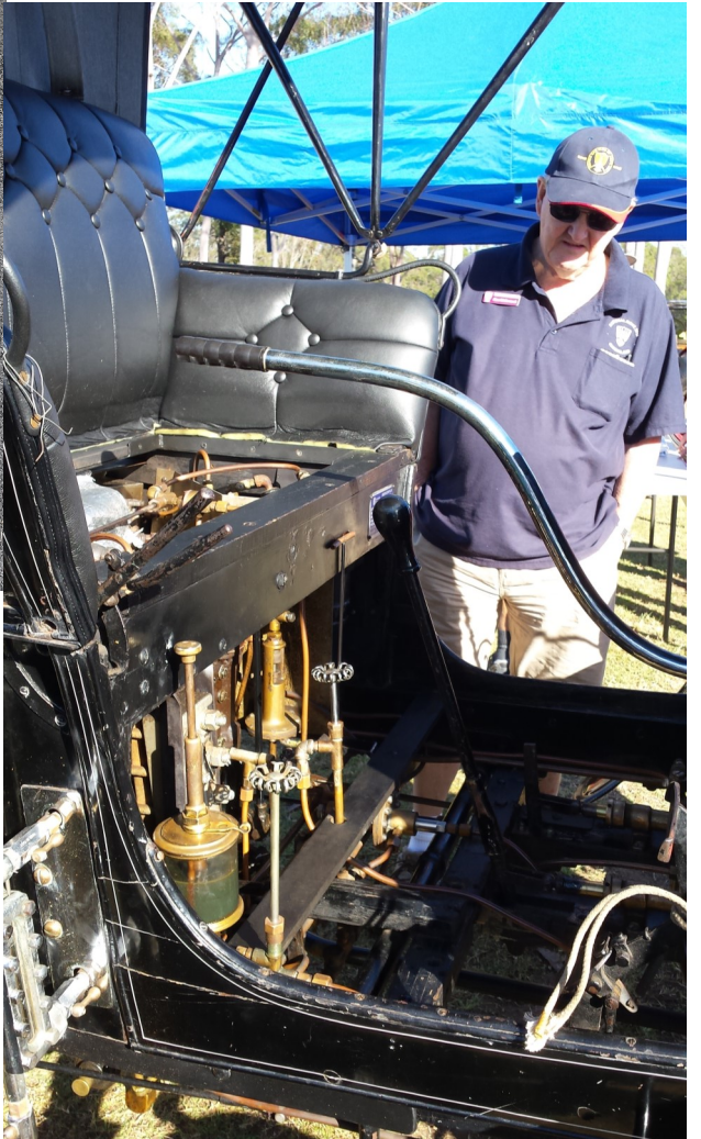
The inner workings of a Steam-driven Car