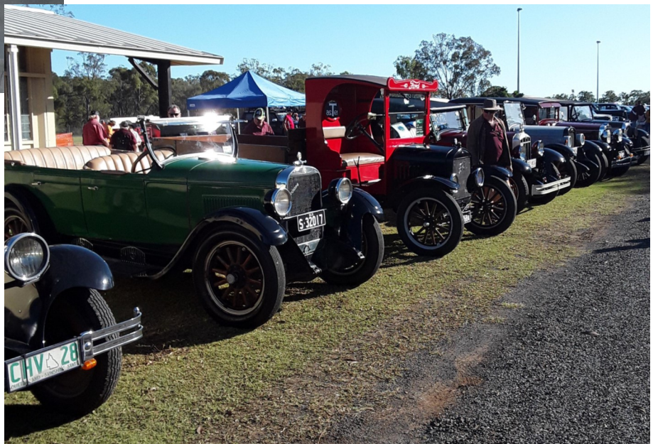
Vintage cars on display