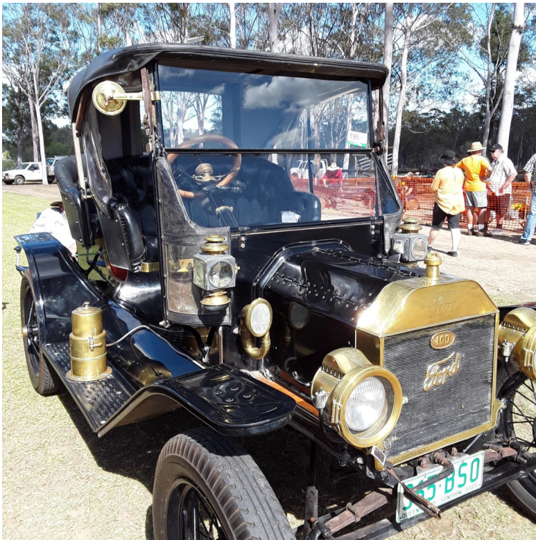
Arguably the best vintage car on display