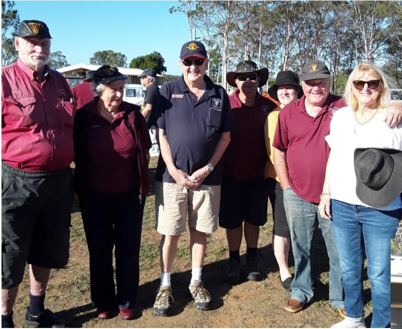
Enjoying the Bundaberg sunshine